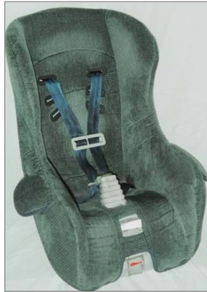
Figure 2-2. Example of a forward-facing CRS