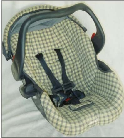
Figure 2-1. Example of an aft-facing CRS