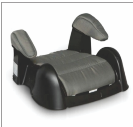
Figure 2-3. Example of a booster seat

2.3.2 Infant sling. A device consisting of a pouch which holds an infant close to the wearer's body. It is not suitable for use as a CRS on board an aircraft. Figure 2-4 presents an example of an infant sling.