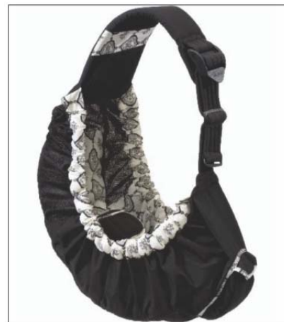
Figure 2-4. Example of an infant sling