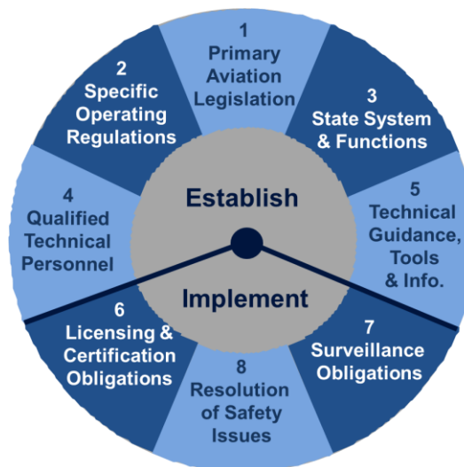
Figure 1. The eight critical elements of a State safety oversight system

To accomplish these obligations, Annex 19 — Safety Management , Appendix 1 identifies eight critical elements (CE) (Figure 1):